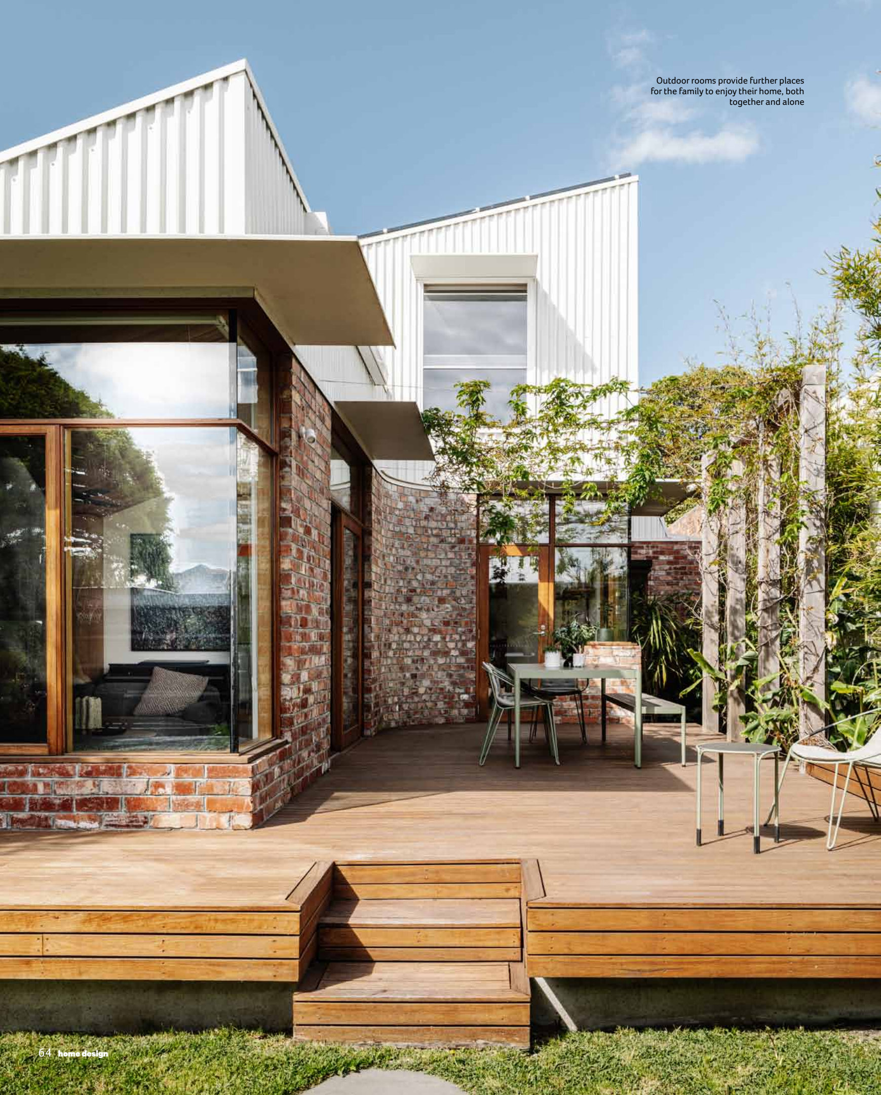
Outdoor rooms provide further places for the family to enjoy their home, both together and alone