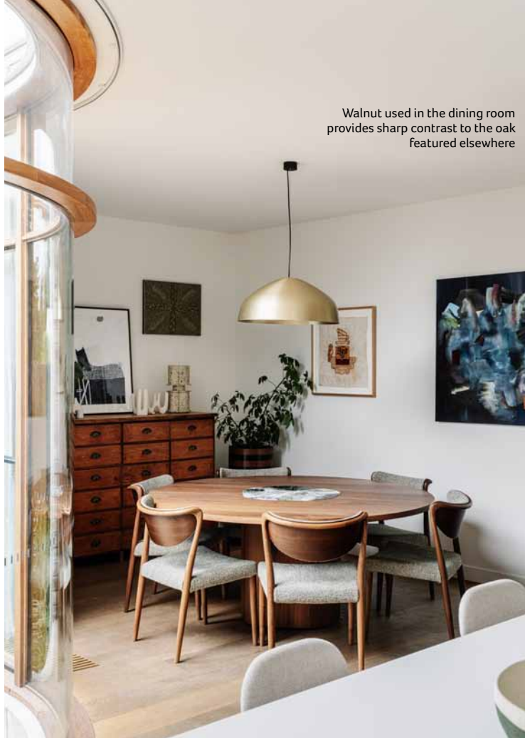
Walnut used in the dining room provides sharp contrast to the oak featured elsewhere

“They are not merely basic outdoor areas; instead, they function as inviting rooms in their own right. These courtyards can host lush greenery, comfortable seating and even decorative elements, creating an oasis” — Emilio Fuscald