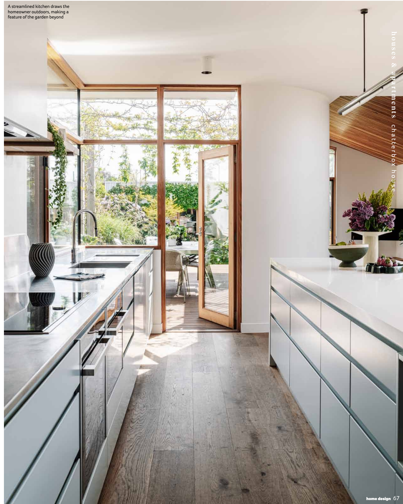
A streamlined kitchen draws the homeowner outdoors, making a feature of the garden beyond

A design solution for this was created by dividing the house into distinct areas with internal light courts. “This allowed light and air to flow through the length of the house while creating separate zones and rooms. We aimed to avoid a simple, large open-plan layout, recognising that our clients desired curated spaces. They wanted the house to tell a story and gradually reveal itself,