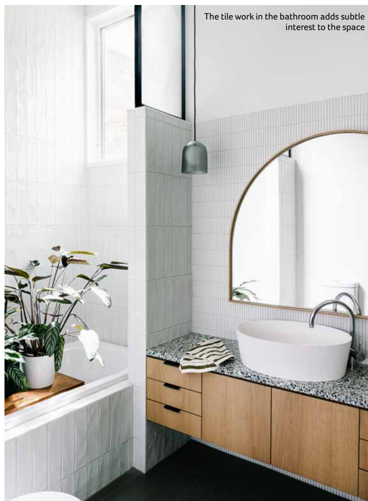
The tile work in the bathroom adds subtle interest to the space