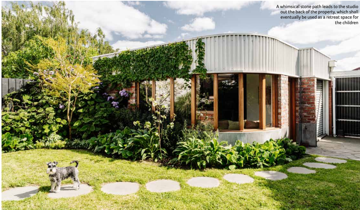
A whimsical stone path leads to the studio out the back of the property, which shall eventually be used as a retreat space for the children