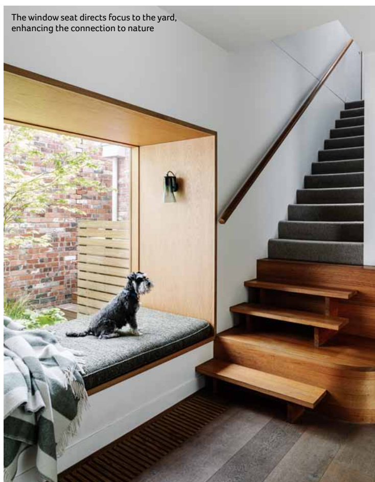
The window seat directs focus to the yard, enhancing the connection to nature

“Our clients loved blue and green, so when creating the palette for furniture and styling, we selected colours that complemented and contrasted these two primary colours”