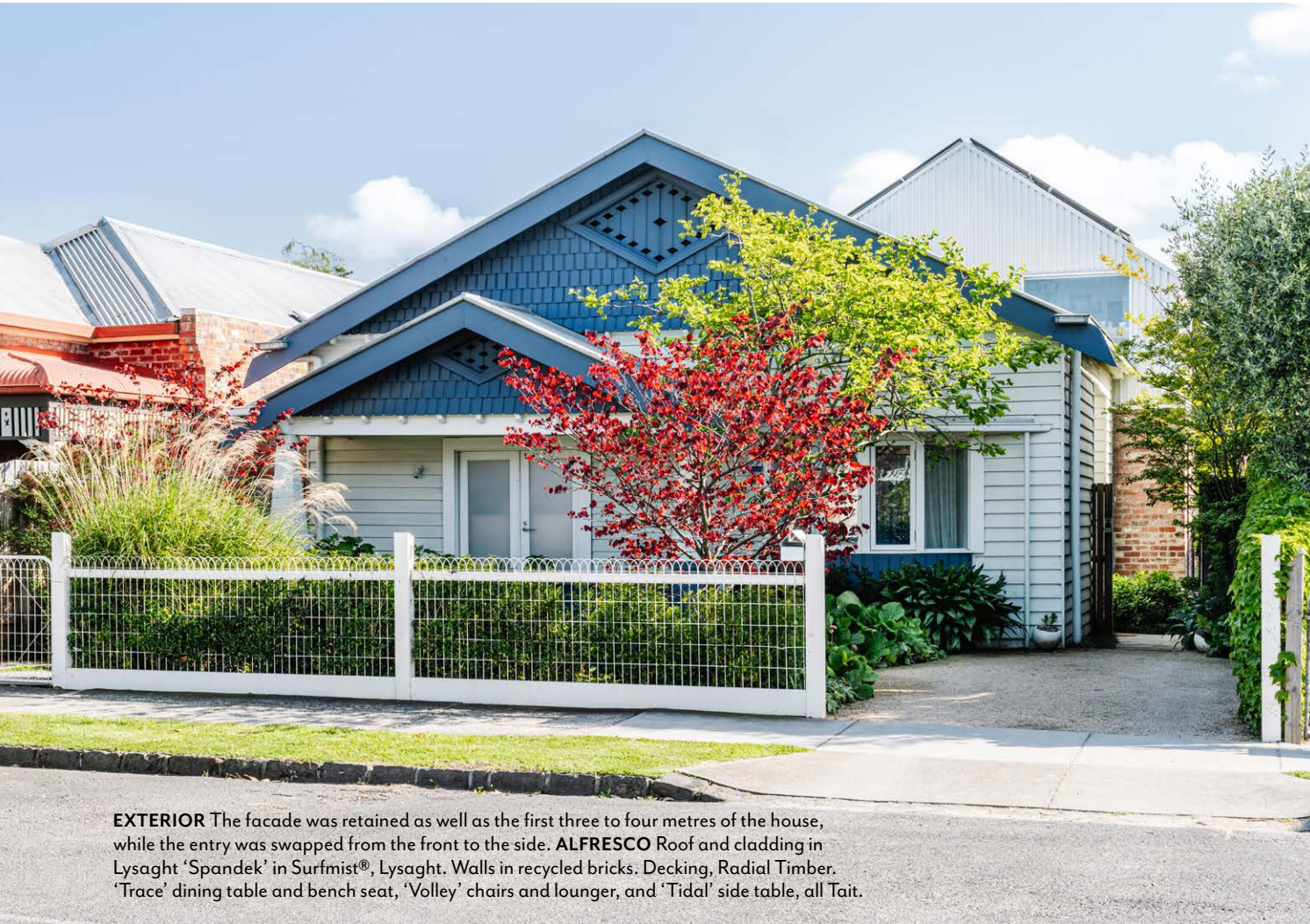
EXTERIOR The facade was retained as well as the first three to four metres of the house, while the entry was swapped from the front to the side. ALFRESCO Roof and cladding in Lysaght 'Spandek' in Surfmist®, Lysaght. Walls in recycled bricks. Decking, Radial Timber. 'Trace' dining table and bench seat, 'Volley' chairs and lounge, and 'Tidal' side table, all Tait.

A thoughtful, extensive renovation has transformed what was once a dark and dated bungalow into a charming and light-filled family home, brimming with considered additions, colourful art and abundant greenery.